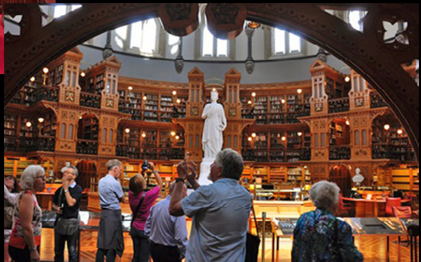
FIDEM Interim Meeting participants tour Parliament Hill, in the library